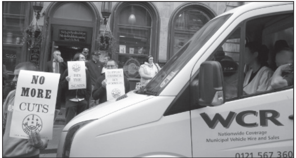
In 2009, a group of IWW members blockaded the lorries of scab workers in solidarity with the council workers, some of whom were later arrested.

Unite's last three meetings with workers have been cancelled without warning or reason being offered. At one of their branch meetings workers expressed their opinion of