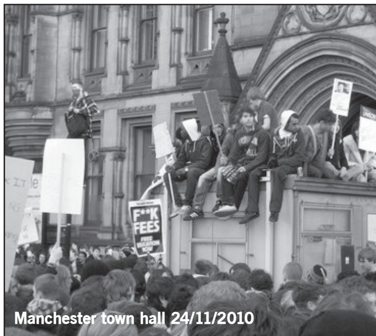
Manchester town hall 24/11/2010

volve all workers and claimants are a positive step forward. We all have an interest in sticking together when it comes to fighting the austerity programme. Only then can we start to put forward serious alternatives to the kind of society we have now where public goods are tailored to the interests of the wealthy few.