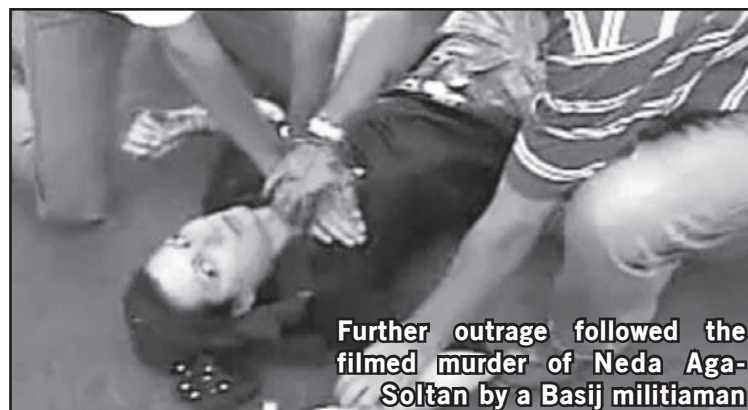
Further outrage followed the filmed murder of Neda Agha-Soltan by a Basij militiaman

Even with the world watching however the Iranian state has not been tolerant of protests – be they peaceful or more militant. Ayatollah Khomeini has banned them and the Basij militia and Revolutionary Guard police have done Continued on page 3 ▶