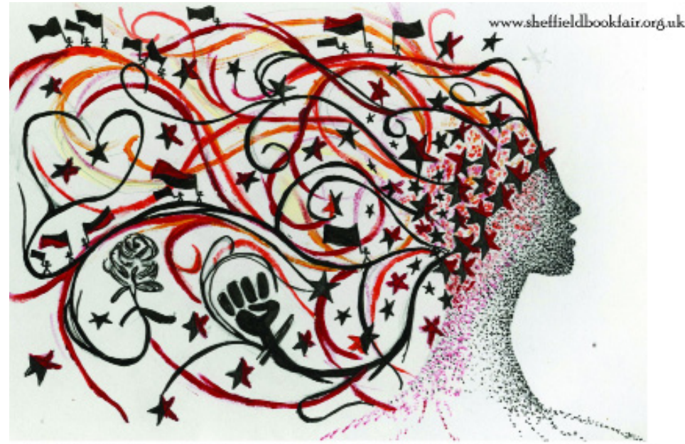
SHEFFIELD ANARCHIST BOOK FAIR // 23rd JUNE 2012 STALLS, TALKS, FILMS, MEETINGS AND MORE...

It has been the position of both politicians and political commentators that