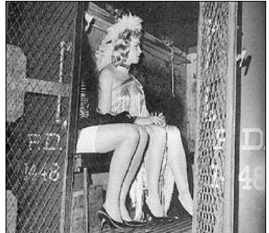
Transgender Stonewall rioters who would today be excluded from the modern corporate lobby group made in their name.

In their website literature they proudly explain that gay people perform better if they're "out" (exploitation is fine, as long as we're exploited as equals). This statement clearly doesn't match the experiences of those making a gender transition, 10% are verbally abused, 6% physically assaulted and as a consequence of this abuse around a quarter are forced to leave their jobs. Stonewall's focus is evidently only on gay people who identify with their current gender and they have no real or significant interest in lobbying for the rights of other vulnerable groups.