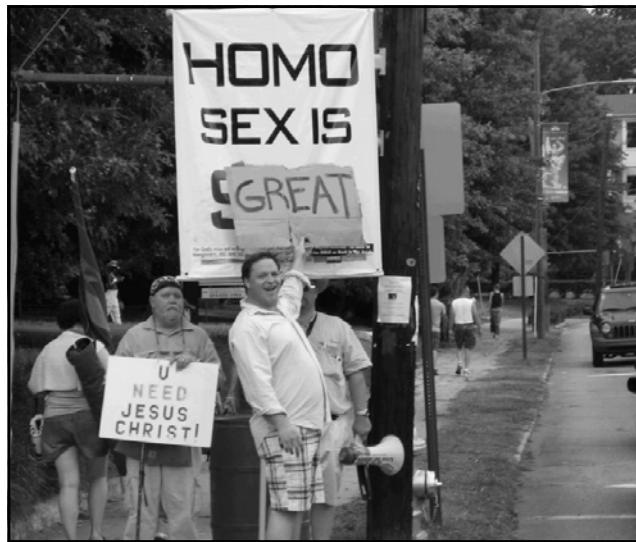
A vigilant member of the Gay community straightens out the facts.

Another example of homophobia and the left coming together is the Socialist Workers' Party's (SWP) role in Respect. Aside from receiving donations from a million-