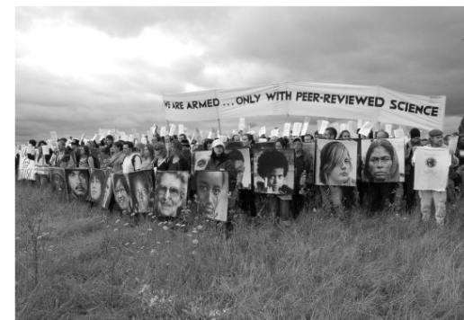
climate campers in action.