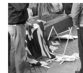
Barnsley BNP Bemused by Bashed Banner