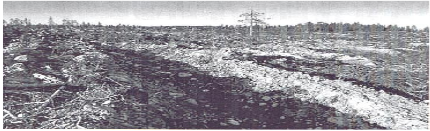
The drive to ever greater profits wreaking havoc on our natural environment.

Capitalism is the most destructive, life crushing system the world has ever seen. It is a global monster that ensures misery for billions of people throughout the world. It is literally eating up the planet, allowing politicians to wallow in corruption - see what's going on in Pakistan for example.