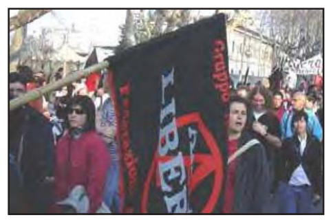
Anarchists marching in Italy

Our aim was to highlight the fact that the world is now facing a situation of "permanent war", which must be resisted both locally and internationally.