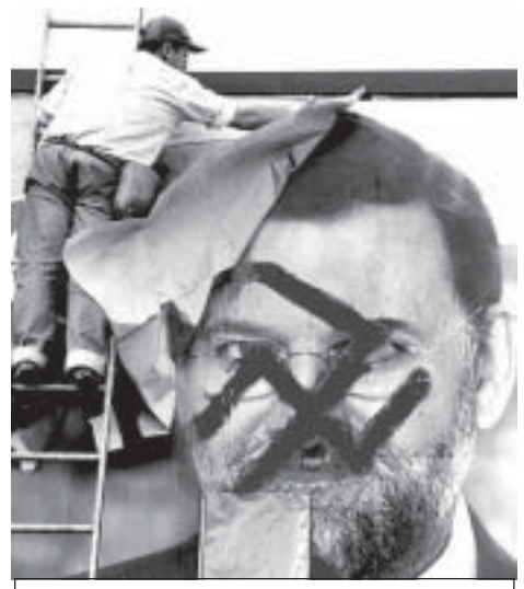
Defaced Popular Party poster

hierarchy, so as to achieve a supposed better world. Only that this is again carried ahead against the will of the individual members of that society, that are tools in the hands of the bureaucrat.