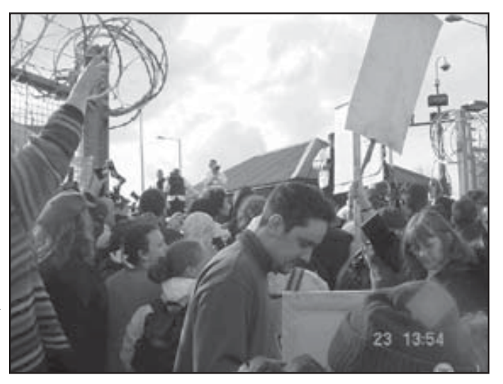
Fairford Airbase stormed - see inside

Unfortunately no symbolic direct actions were attempted, although obviously there were many in the crowd who will be ready to take direct action against the war effort in future. Present were libertarian