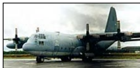
It's not Aer Lingus!

Meanwhile observers who had reached the main terminal building saw a Hercules US military plane land, and quickly take off again without re-fueling, presumably