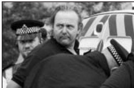
This farmer over-reacted slightly by trying to run protesters over with a tractor