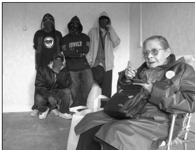
ANTIFA - good with their nans.

Door-to-door leafleting of local areas took place before the event. Then, on August 16th, a demonstration and rally took place in the nearby town of Codnor. Elsewhere on the day, anti-fascist activists took part in a creative direct action that gave the police a headache by blocking a road near to the festival site, in order to prevent access to the