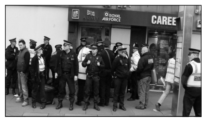
Police Federation negotiations take a turn for the worse as South Yorkshire Police seek a new career path.

war and militarism include invasion of a lecture on aerial warfare and the disruption of arms dealers at a careers fair. *