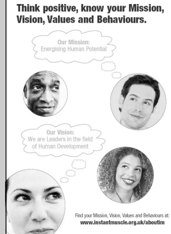
Think Positive - advert for Instant Muscle

Instant Muscle were one of the organisations that jumped on the workfare gravy train when the Conservative Party introduced 'Project Work' in the 1990s, which became New Deal for the unemployed after the Labour Party got into power. The idea was that you would get work experience for 10 quid plus your dole. This is an