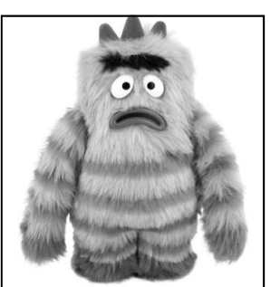
Officer Brobee - "OH HAI GUYS.

Scotland Yard said a review was taking place into the security breach... BEST HACK EVA!