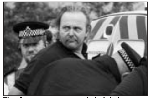
This farmer over-reacted slightly by trying to run protesters over with a tractor